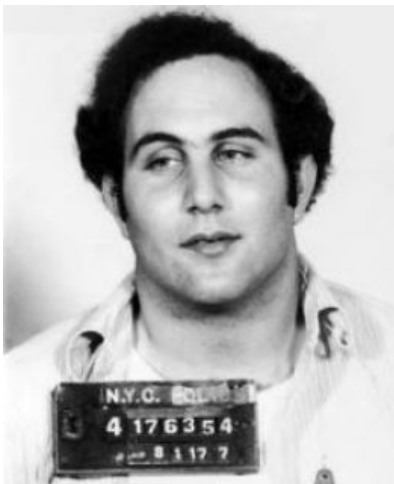
Son of Sam

As I write this, I listen to The Hand That Feeds by Trent Reznor (Nine Inch Nails). I must confess: NIN is one of my guilty pleasures. This man sings of his hatred in a way that is very inviting and powerful. I pray for people like him, because if this is the power of music he makes for depravity, how wonderful could his music for God be! He is very creative. I pray the same thing for Björk. Her music captivated me while I was in the throws of self-idolization. Now I recognize I heard what I wanted to from her music, and it led me astray. I can't listen to much of her music anymore, for the things that led me to sin still hold that power of hurt. I pray for her too, though, because she is so wonderfully creative and I long to hear what she can do for Christ. I know I pray for wrong reasons (I want good music), but I do.