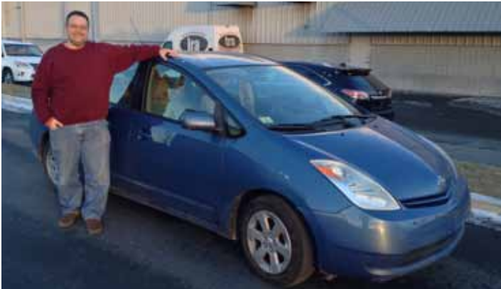
2004 Toyota Prius - Skye 1,869.0 Miles